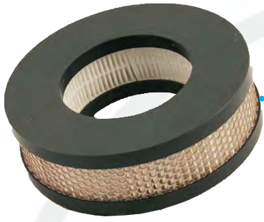
Patented Copper Coated HEPA Filter

This specialized filter features a "bacteriostatic" copper cage to trap particulate matter and reduce the potential for chamber contamination. This filter removes 99.97% of all airborne microbes